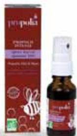
ORGANIC ORAL SPRAY

Soothing oral spray with propolis, honey & thyme