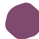
LEGS & MUSCLES CARE - PURPLE -

"Breathe deeply": this colour represents the air and its importance to easy breathing.