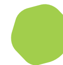
PURIFYING COSMETICS - APPLE GREEN -

Vibrant pink, the colour of hot and red skin and its need for immediate care!