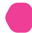
À BRAS LE CORPS® - MAGENTA -

This deep purple colour suits and suggests muscle relaxation and relates to the blood system.