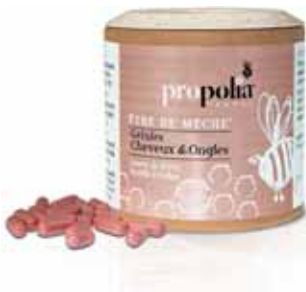
Ref : GELUCHEVEU

Take 3 capsules per day, (preferably on an empty stomach), over a 3- month period (1 container per month). To be renewed 2 to 3 times a year.