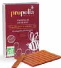
ORGANIC PROPOLIS TO CHEW

100% purified organic propolis in sticks