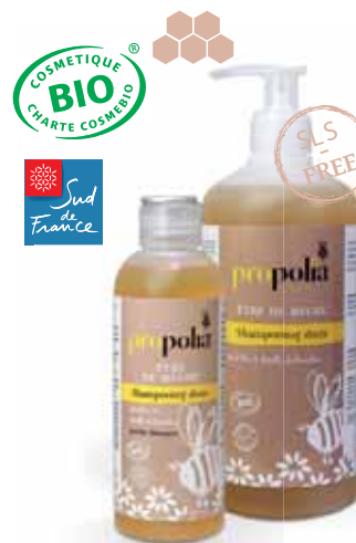
Ref. SHAMIELBIO GFSHAMIELBIO (500ml)

Apply on wet hair and gently massage the scalp. Rinse with clear water and shampoo again if necessary.